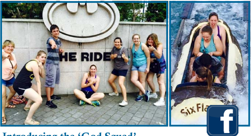
Introducing the 'God Squad'

We commit our gifts to life-long learning.